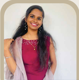
PREETHI HOSPITAL ADMINISTRATION AND ACCOUNTING