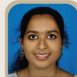
ASWATHY B S HOSPITAL ADMINISTRATION AND ACCOUNTING