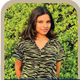
ATHULYA HR AND OFFICE ADMINISTRATION