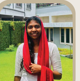
ALFIYA P I HOSPITAL ADMINISTRATION AND ACCOUNTING