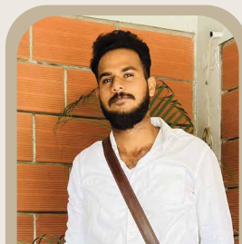
FASIL T S LOGISTICS AND SHIPPING MANAGEMENT