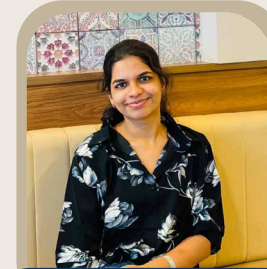
MEGHA AJI HOSPITAL ADMINISTRATION AND ACCOUNTING