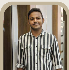
NAJEEL N LOGISTICS AND SHIPPING MANAGEMENT