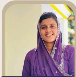
ASIYA BEEVI HOSPITAL ADMINISTRATION AND ACCOUNTING