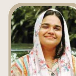
FATHIMA FARIDHA HOSPITAL ADMINISTRATION AND ACCOUNTING