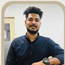
NAJEEM E N LOGISTICS AND SHIPPING MANAGEMENT