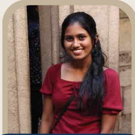
FEMINA HR AND OFFICE ADMINISTRATION