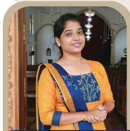
PRETTY MATHEW HOSPITAL ADMINISTRATION AND ACCOUNTING