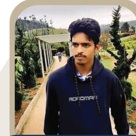
JOVEEN JOHN LOGISTICS AND SHIPPING MANAGEMENT