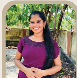
PARVATHY P HOSPITAL ADMINISTRATION AND ACCOUNTING