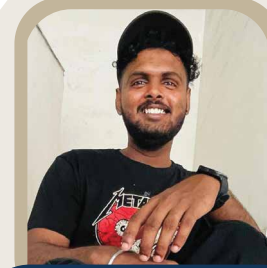
ALAN KUNJUMON SHIP BUILDING AND REPAIR MANAGEMENT